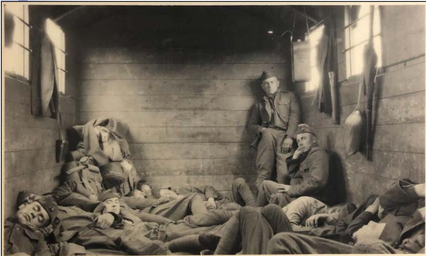
62nd Marine Guard Company en route to Brest, France July 1, 1919